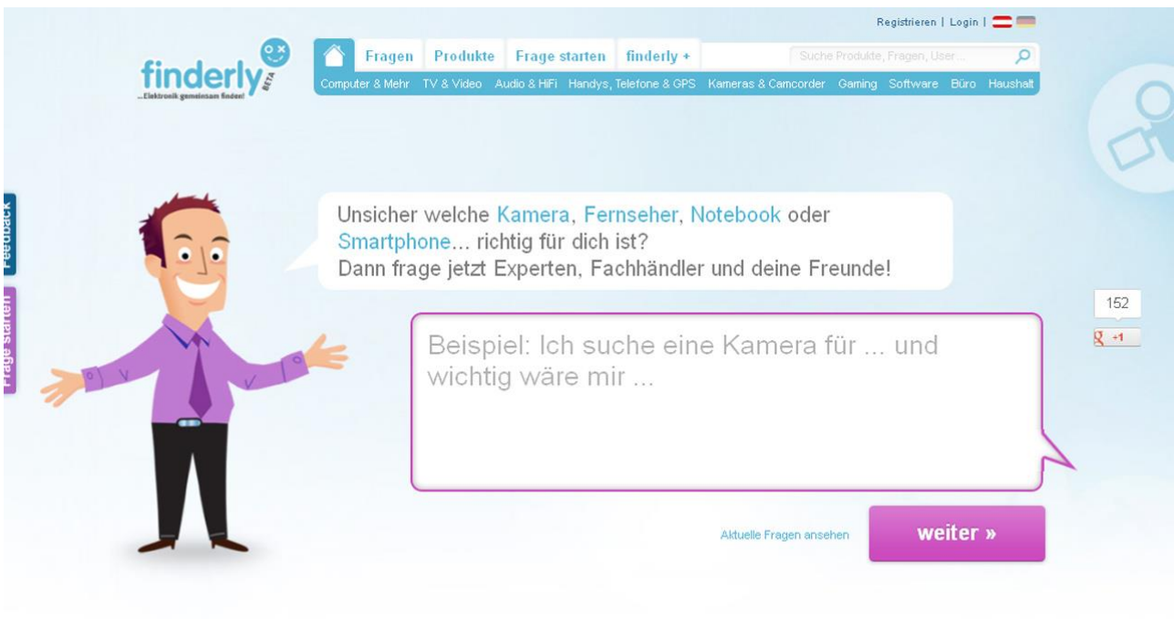
Exhibit 2 – Welcome screen of Funderly in web browser